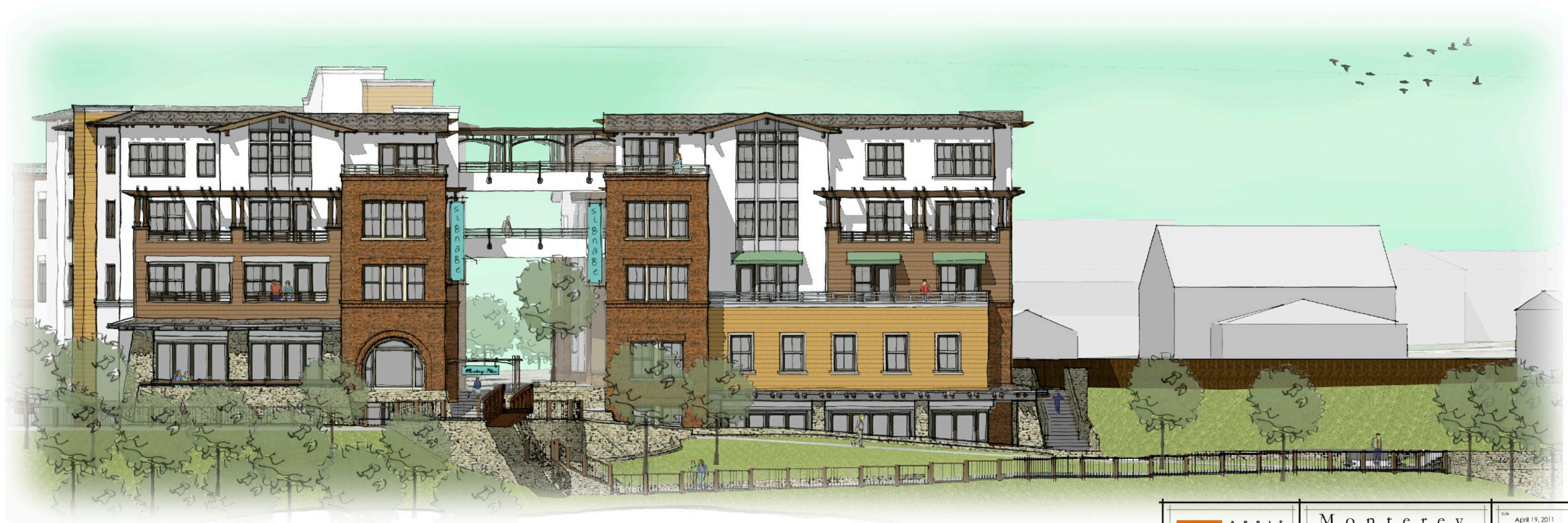
SCHEMATIC ELEVATION - VIEW FROM CREEK - PHASES 1 & 2