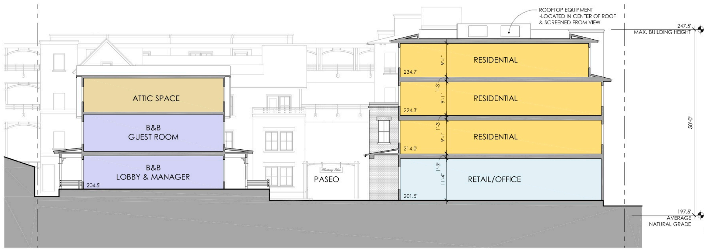
SCHEMATIC BUILDING SECTION D