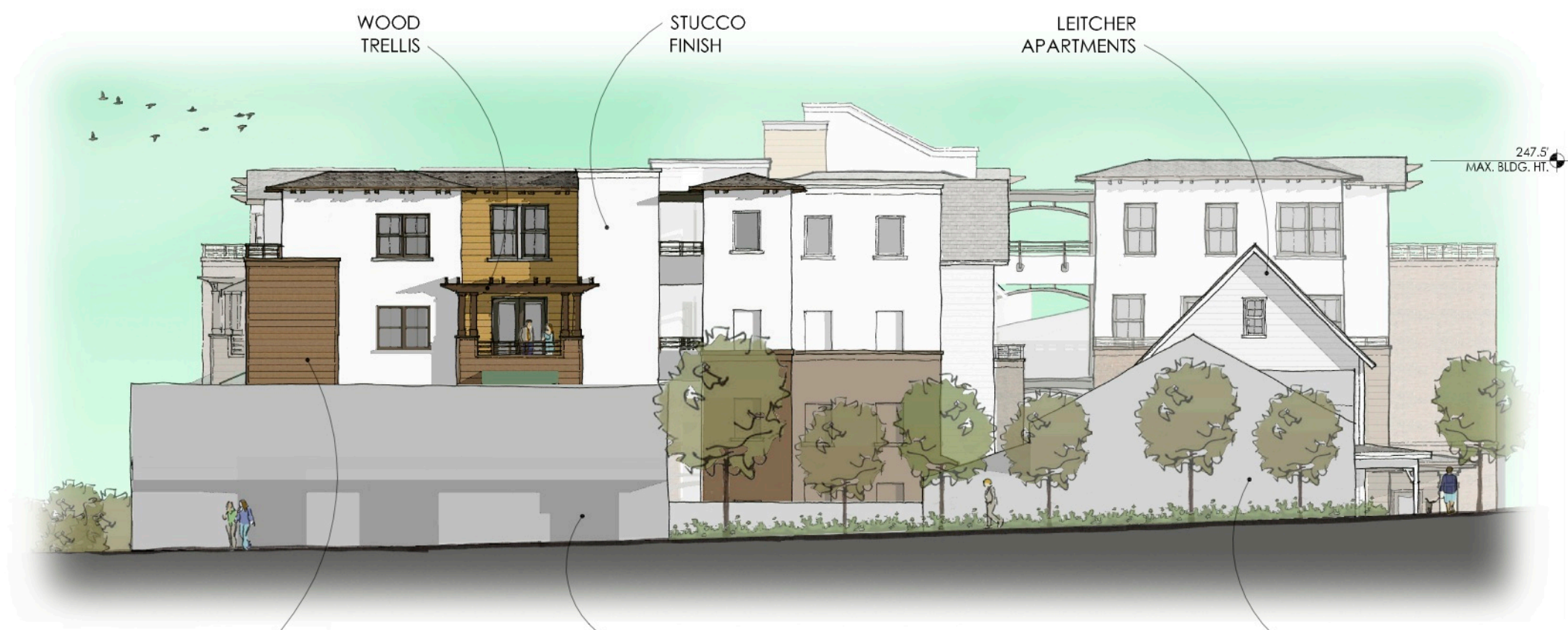
SCHEMATIC ELEVATION - BROAD STREET