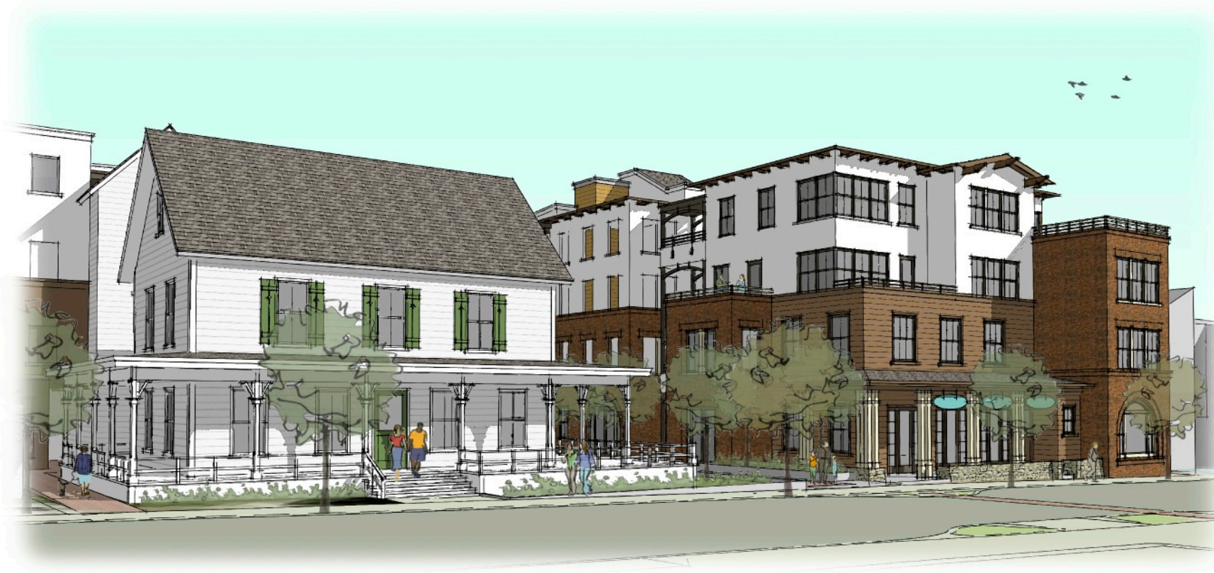
PERSPECTIVE #3 - VIEW FROM MONTEREY STREET