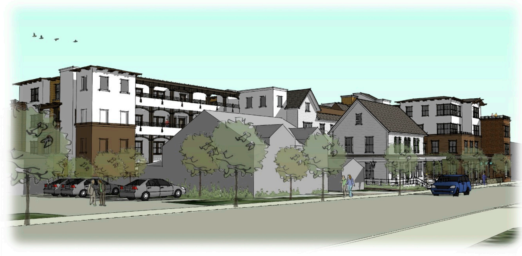
PERSPECTIVE #4 - VIEW FROM CORNER OF MONTEREY AND BROAD STREET