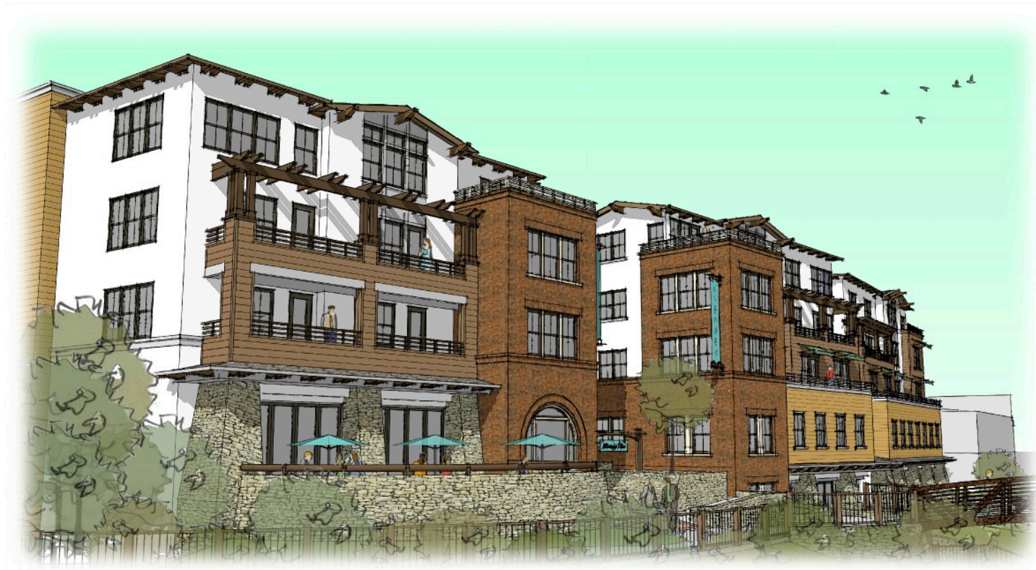
PERSPECTIVE #2 - VIEW FROM NIPOMO STREET