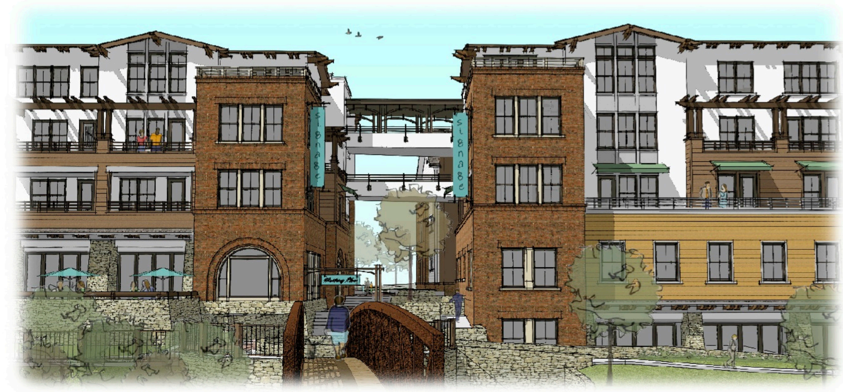
PERSPECTIVE #1 - VIEW FROM CREEK